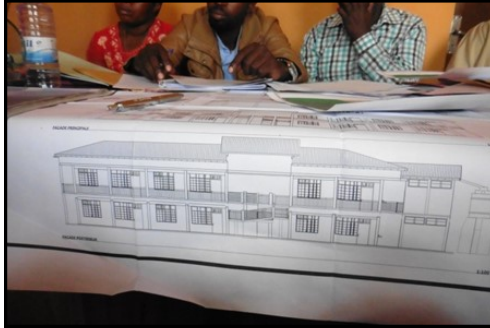
Construction contract details for the school required extensive meetings. La Salle International's sister organization in Spain, PROYDE, has been active in the planning, bidding and oversight of this project.

have been busy getting all of the appropriate administrative and legal details in order for this new educational venture: ecclesiastical letters, governmental approvals, regional permits, and construction bids/contracts, etc.