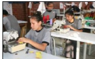
Fe y Alegria School No 43 Lima, Peru Education $ 11,200