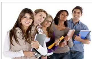
Institut Polytechnique LaSalle Beauvais, France Education $ 21,266.00 USD