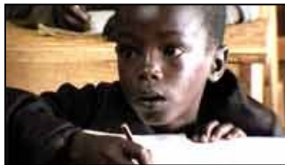
St. Mary's Child Rescue Program Nyeri, Kenya Education $ 32,800.00 USD