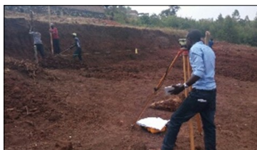
Because of the uneven terrain, the site required considerable excavation along with the construction of lines for both water and electricity.

The recent General Chapter of the Sisters have been informed about the progress of this work and they are happily anticipating the start of their first educational apostolate in Africa.