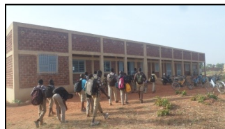
Ecole Lasallienne - Kirit Bobo Dioulasso, Burkina Faso Education $2,689.00 USD