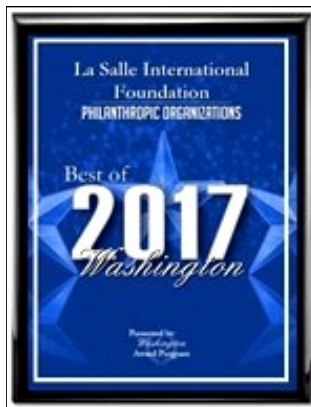
La Salle International was named the "2017 Best Philanthropic Organization in Washington DC."

In accordance with our status as a 501(c)(3) public charity, a Form 990 has been filed with the Department of the Treasury and the Department of Regulatory and Consumer Affairs, Washington DC for the 1 July 2016 to 30 June 2017 fiscal year.