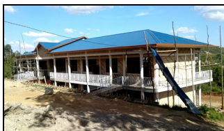
Daniel and Erik Gaviria School Kamazuzi, Rwanda Education $ 50,000.00 USD

The following activities, programs and institutions were sponsored from donations received by La Salle International Foundation, Inc. between July 1, 2014 and June 30, 2015.