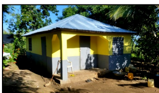
Caritas Île de Tortue Île de Tortue, Haïti Humanitarian $13,550.00 USD