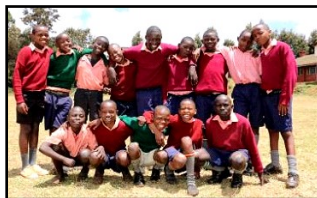
St. Mary's Child Rescue Program Nyeri, Kenya Education $ 56,200.00 USD