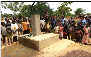
Pontièbba Village Pontièbba, Burkina Faso Health $ 10,355.00 USD