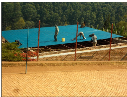
Roofs, ceilings and internal furnishings were replaced in this facility which helps street children reconnect with families.

Through the support of the Loyola Foundation, new dormitory roofs and ceilings were installed at the Intiganda Centre