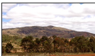
Sœurs Guadeloupaines De La Salle Mamoeramanjaka, Madagascar Health $ 10,875.00 USD