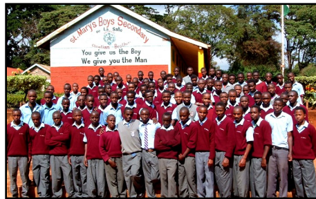
La Salle International scholarship support enables 45 children from the slums to attend St. Mary's School (Kenya) where they academically outperform public schools students in the same grade.

Even modest scholarships can provide the incentive families need to send their daughters to school. In doing so, their country achieves gender equity and their daughters break through educationally-limited glass ceilings.