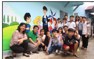
La San Tan Hung Charity School Ho Chi Minh, Vietnam Education $ 6,000.00 USD