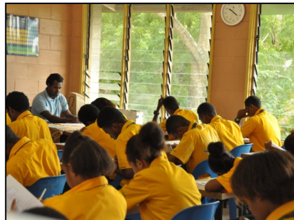
Educational improvement in PNG is a collaborative funding priority.

La Salle International has worked with this foundation over a number of years and commonly held missions, outcome objectives, and dedication to improving educational opportunities for the less fortunate are all reasons closer collaborations should be fostered. Already, the two foundations have worked on proposals which would help fund educational improvements in several different countries. Donor agencies appreciate this kind of collaboration and tend to look favorably on grant proposals which draw on the experience and knowledge of these two foundations working together.