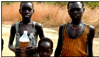
Solidarity with South Sudan Riminze, South Sudan Humanitarian Aid $ 2,000.00 USD

The following activities, programs and institutions were sponsored from donations received by La Salle International Foundation, Inc. between July 1, 2017 and June 30, 2018.