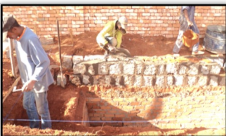
Notre-Dame du Bon Conseil Mamoeramanjaka, Madagascar Health $ 3,500.00 USD