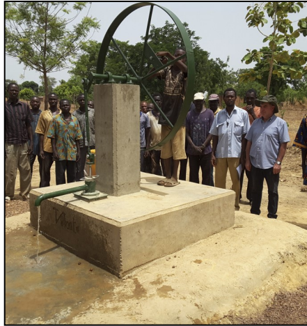
Construction of a well at Pontiebe eliminated daily 4-mile walks to obtain water from another source. (Global Development Goal 6)

and job opportunities, while tackling climate change and environmental protection.