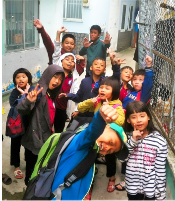
These children of street vendors would be without education if it were not for the services of La San Tan Hung Charity school in Ho Chi Minh City, Vietnam.

services. Larger schools benefit from economies of scale which are not available to smaller institutions. An increased number of professionals creates a positive school environment, offering greater resources and often providing students smaller classes with individualized attention.