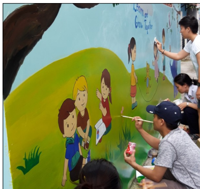
Collaborative funding provided enhancements at the La San Tan Hung Charity School in Vietnam

In an effort to match donor-funding opportunities with optimal areas for positive change, La Salle International Founda-