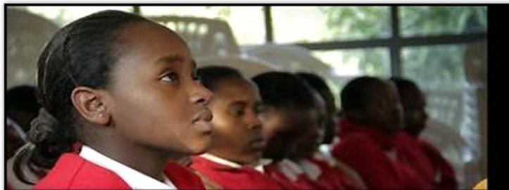
Construction of a dormitory at La Salle Secondary School in Karemno, Kenya will ensure girls are able to safely continue their education and graduate at the same rates as boys. (Global Development Goals 4 and 5)

Conformity to the SDGs is a part of all projects sponsored by La Salle International. While previous development models relied on governmental action, the private sector is now broadly acknowledged by the international development community to be a key driver in alleviating poverty. In this regard, La Salle International invites donors to partner with us to create a future we all want for a better world.