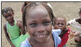
Sacre Coeur de Aux Plaines School Île de Tortue, Haïti Education $1,050.00 USD