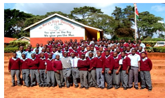
St. Mary's Child Rescue Program Nyeri, Kenya Education $ 30,500.00 USD