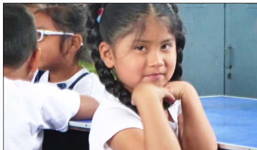
Scholarships support the education of socially marginalized students at San Juan de Lurigancho, Peru.

As we say in our values statement, there is no “silver bullet” to solve all of the world’s problems . . . but education is about as close as we can get. Education, makes