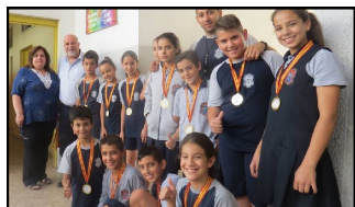
College des Frères Beit Hanina & Bethlehem Education $ 17,600.00 USD