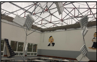
Disaster Relief: Hurricane Idai Beira, Mozambique Humanitarian $ 17,469.00 USD