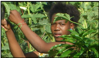
Centre Lasallien d'Initiation aux Metiers de l'Agriculture (CLIMA) Bérégadougou, Burkina Faso Education $ 20,000.00 USD