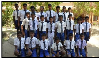
Nanattan Maha Vidyalay School Nanattan, Sri Lanka Education $ 20,000.00USD