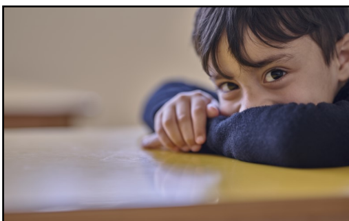
The Fratelli Project prepares children for entry into the Lebanese school system and supports their success.

Understanding how Lebanon's social services are overwhelmed by the steady tide of refugees, the De La Salle Brothers have teamed up with the Marist Brothers to create the Fratelli Project .