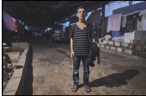
Life as a Syrian immigrant living in Lebanon can be difficult, and even more so for the children. To address the various needs of refugee Syrian youth, the Fratelli Project has offers 14 different supportive programs.

admission to public schools through 14 different programs.