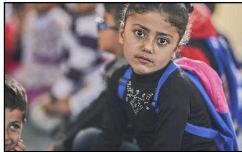
Special efforts are made to enroll girls in Fratelli's socio-educational programs.

Their programs extend from educational training and support, to psychological counselling for children, nutritional support, and even language instruction for refugee adults.