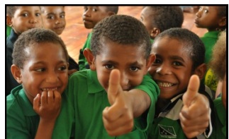
Rebiamul Catholic Youth Center Mt. Hagen, Papua New Guinea Education $ 3,000.00 USD