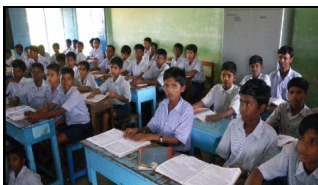
La Salle Secondary School Tuticorin, Tamil Nadu, S. India Student scholarships $ 950.00