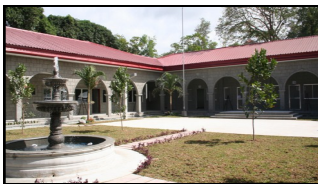
Bahay Pag-asa Center Cavite, Philippines Educational support $ 500.00

The following activities, programs and institutions were sponsored from monies donated to La Salle International between July 1, 2010 and June 30, 2011.