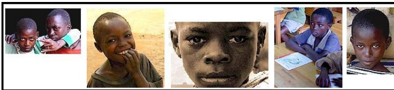
Vignettes from inside the protective walls of the Intiganda program in Rwanda, where street children find a safe haven for them to live, educationally advance themselves, and receive the medical and psychological attention of a professional staff.

In its efforts to strengthen such programs, the International Lasallian Solidarity and Development Commission has identified close to a dozen programs which will form the basis for collective action by the various Lasallian NGOs around the world. Work is progressing to identify the various programs’ components and to draft case statements which can be used by the NGOs for requesting funding assistance. The programs were selected on the basis of their service to diverse groups of youth, the country in which they are located, the strength of the program, and their ability to move towards economic self-sufficiency. It is hoped that these programs will serve as a model for other Lasallian youth-at-risk programs and that their success could be replicable to other youth-at-risk programs. La Salle International will continue to work towards obtaining funding for these programs and for other programs around the world.