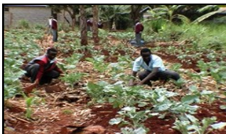
St. Mary's Boys' Secondary School Nyeri, Kenya Child Rescue Program $ 549.53