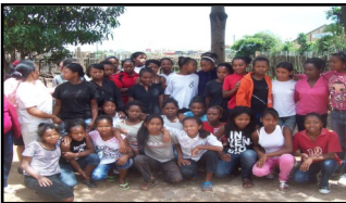
Social Center for Women's Promotion Anosibe, Madagascar Construction grant $ 60,000.00