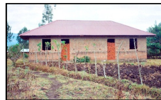
Okou Nursery School Entebbe, Uganda Construction Grant $ 1,500.00