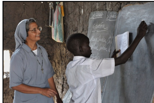
La Salle International has assisted Solidarity with South Sudan since its very beginnings by funding school construction and scholarship efforts for the people of South Sudan.

Thanks to the CPA, peaceful conditions in 2006 permitted Solidarity with South Sudan to begin establishing its community houses and instructional centers so that educational programs could be offered to the people of South Sudan. Communities were established in Juba, Malakal, Wau, Yambio, and Riiminze.