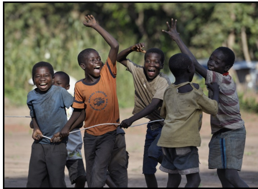
In the Makpandu refugee camp, displaced youth play games organized by a pastoral team which has accompanied the youth since the beginning of the camp in 2008.

youth at-risk centers which focus on children who are educationally excluded, children of immigrants, refugee children, street children, orphans, adjudicated youth, incarcerated youth, drug addicts, emotionally or physically unstable youth, sex