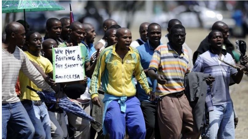
Striking mineworkers gather outside the Anglo-American Platinum mine in Rustenburg, South Africa. The strike lasted 5 months.

vide lunch and water for the primary school children who are attending schools in the camps. There were no electrical or water facilities at the squatter camps; as such, the miners who had to pay for their water and the water of their children. Now ended, the strike cost the platinum producing company $400 million USD.