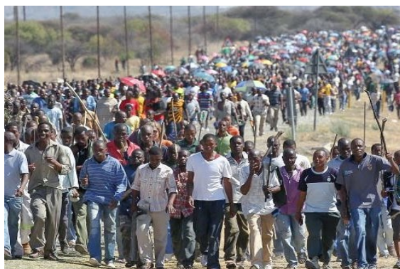
In Rustenberg South Africa, La Salle International help provide emergency relief services and food to striking mineworkers in South Africa during the 2013-2014 year.

vide lunch and water for the primary school children who are attending schools in the camps. There were no electrical or water facilities at the squatter camps; as such, the miners who had to pay for their water and the water of their children. Now ended, the strike cost the platinum producing company $400 million USD.