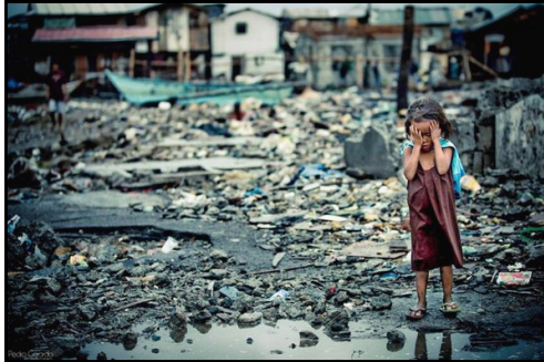
La Salle International, utilizing the network of De La Salle Brothers on the ground in the Philippines, assisted in providing not only immediate disaster relief, but long-term educational facilities for youth in the Philippines.

Negros Occidental, Antique Capiz, Iloilo and the northern part of Cebu.