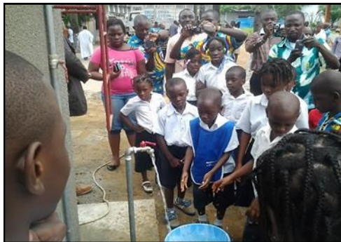
Clean water is now available to students at College Frère Zuza in Kinshasa, Congo.

This project provided enough water to satisfy the needs of the school and to improve the functionality of the school's bathrooms which serves 2,604 people on a daily basis.