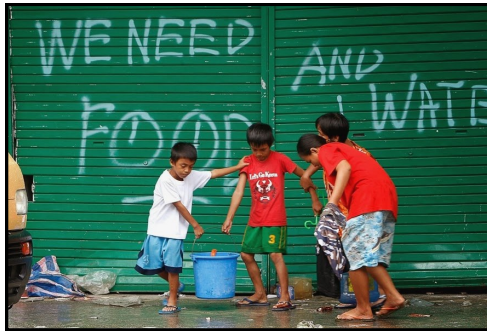
Through the Lasallian network, funding was provided which helped to fund the distribution of more than 37,373 relief packs to meet emergency needs.

While the vast majority of De La Salle operations in the Philippines were not significantly impacted by the storm, De La Salle Philippines (DLSP) and its network of Lasallian schools banded together to immediately respond and actively take part in the relief efforts for communities which were affected.