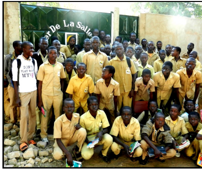
Residents of the St. Joseph's Hostel.

Understanding the importance of providing basic needs and providing a healthy place in which to grow and mature, the St. Joseph's Hostel is a welcomed harbor of safety for impoverished youth attending Collège d'Enseignement Général et Technique - Saint Joseph. This school teaches life-giving technical skills to young boys. In its seventh year of existence, already it has reputation of accomplished educational offerings in technical training. Of the graduates sitting for certifying exams during the past three years, 100% have passed the exam.