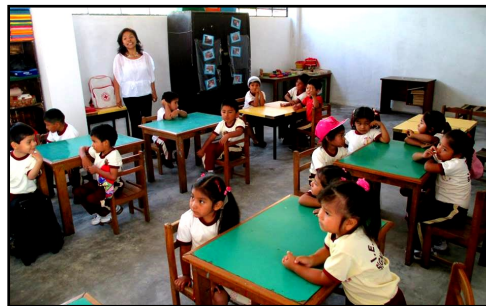
The completed new classrooms are appreciated greatly by both students and staff.