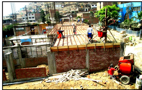
Construction of a second floor provides necessary educational areas to a school building in Perú.

With almost one million inhabitants, San Juan de Lurigancho is the most populated district of metropolitan Lima. It also is the poorest district, with 50% of its people being economically classified "poor" and an additional 11% of its people "destitute." Children are needed to help at home and as wage-earners for their families, so often they do not attend school.