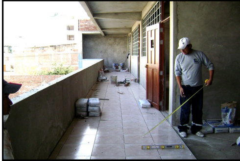
La Salle International, collaborated with Association Tarpusunchis to secure proper funding for the construction of educational areas in Signos de Fe schools in San Juan de Lurigancho and Trujillo.

An energetic group of Lasallian volunteers, conduct schools throughout Peru known as “Signos de Fe” (Signs of Faith). In doing so, they provide extensive educational opportunities for children in both of these locations.