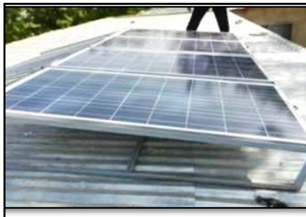
Photovoltaic power from the sun will now allow hostel students to use the evening hours for reading and recreation..

Thoughtfully, caringly, and quietly, he has made a huge difference in the lives of many youth on the other side of the world.