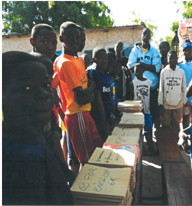
Excitement mounts as cartons of books arrive for their hostel library.

And when some of the students were concerned about their safety from undesirable people (and animals) which were straying into the student's compound, he made arrangements for a protective fence to be constructed around the compound.