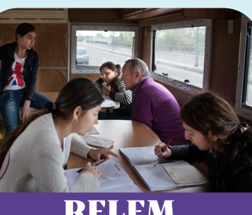
Lasallian Region of Europe & Middle East

La Salle Keesara, India. Promoting Girls access to Science, Technology, Engineering, Arts, & Mathematics (STEAM) Education.