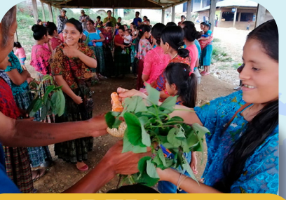
RELAL Lasallian Region of Latin America

Fratelli Project, Lebanon. Non formal educational center for syrian and iraqi refugee children and youth.