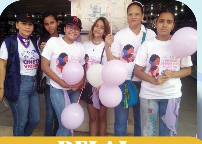
RELAL Lasallian Region of Latin America

La Salle Scampia, Italy. Increasing female employability in vulnerable communities.