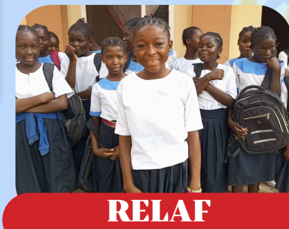
Lasallian Region of Africa

Fratelli Project, Colombia Professional training for women from indigenous and displaced communities.