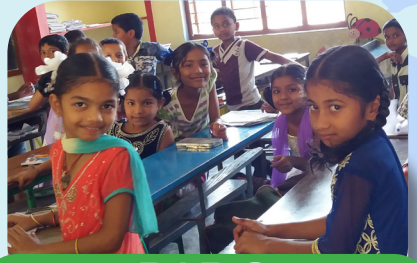
PARC Lasallian Region of Asia & Oceania

Your contribution to the 1 La Salle Campaign will support initiatives aimed at promoting access to education for women and girls, particularly in contexts where they face significant challenges in pursuing their educational journey. and realizing their dreams.